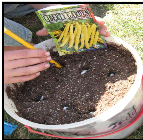
Planting large seeds

For more information about your specific area, check Section Four of Part One of the Got Dirt? Toolkit ( www.gotdirtwisconsin.org ).