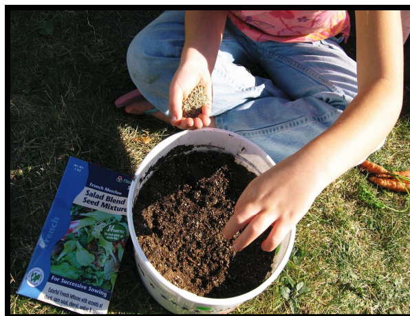
Planting small seeds

Look for seed packets that describe the larger vegetables like tomatoes, zucchini and bean plants as compact , bush , tiny , dwarf , patio , early or short . These plants require less space and are ideal for container gardening. Select seeds in early spring for best selection. Most stores only stock seeds in the spring and early summer. However, seeds can be ordered online or through catalogs any time of the year.